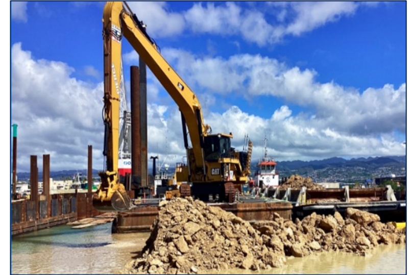
PHNS DD 5 Dredging